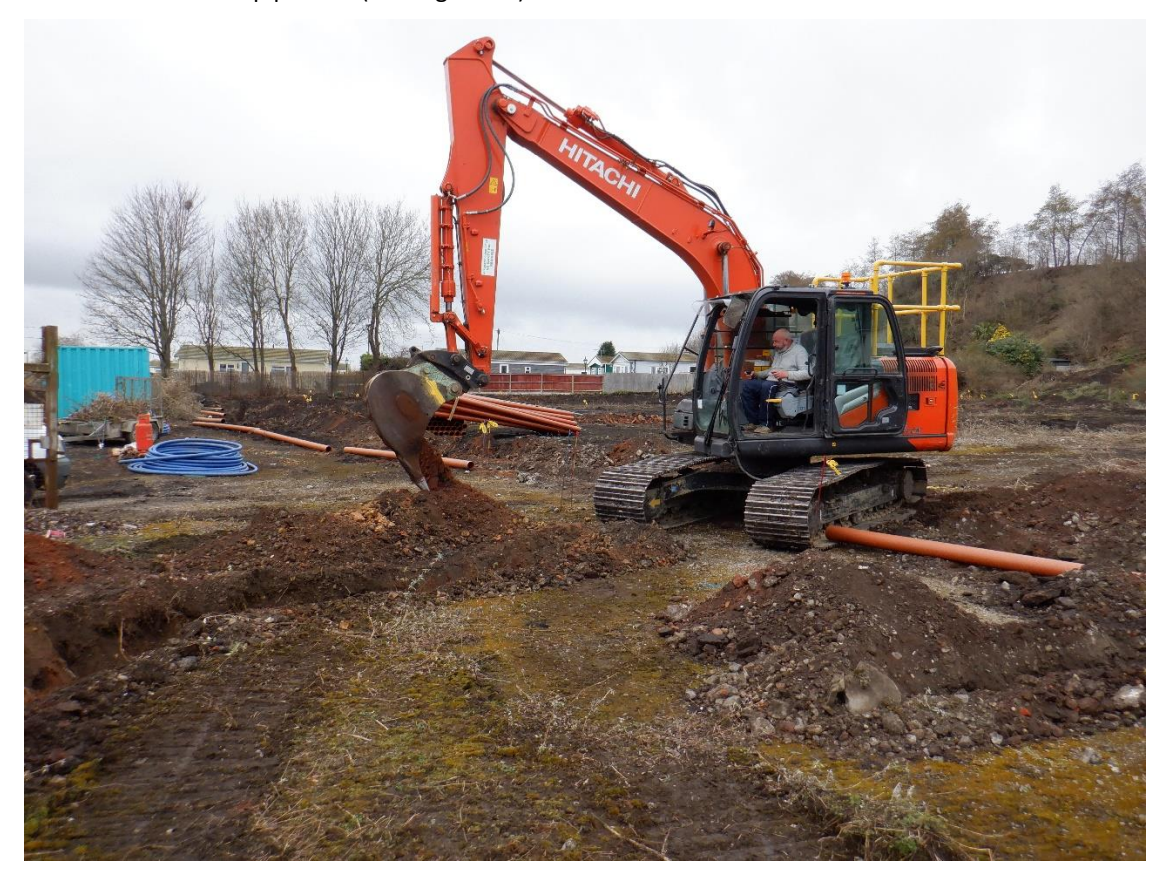
Plate 2. Service pipe run trenching (looking West)