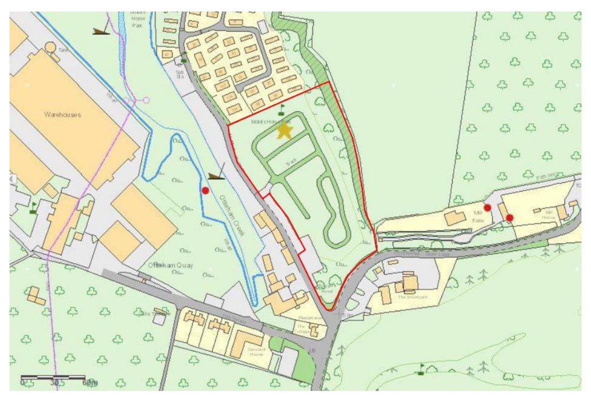
Figure 3. Proposed area of development and area watched (within red line)