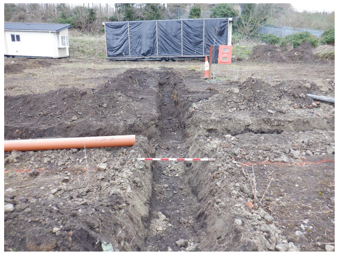
Plate 4. Service trenching (looking South)