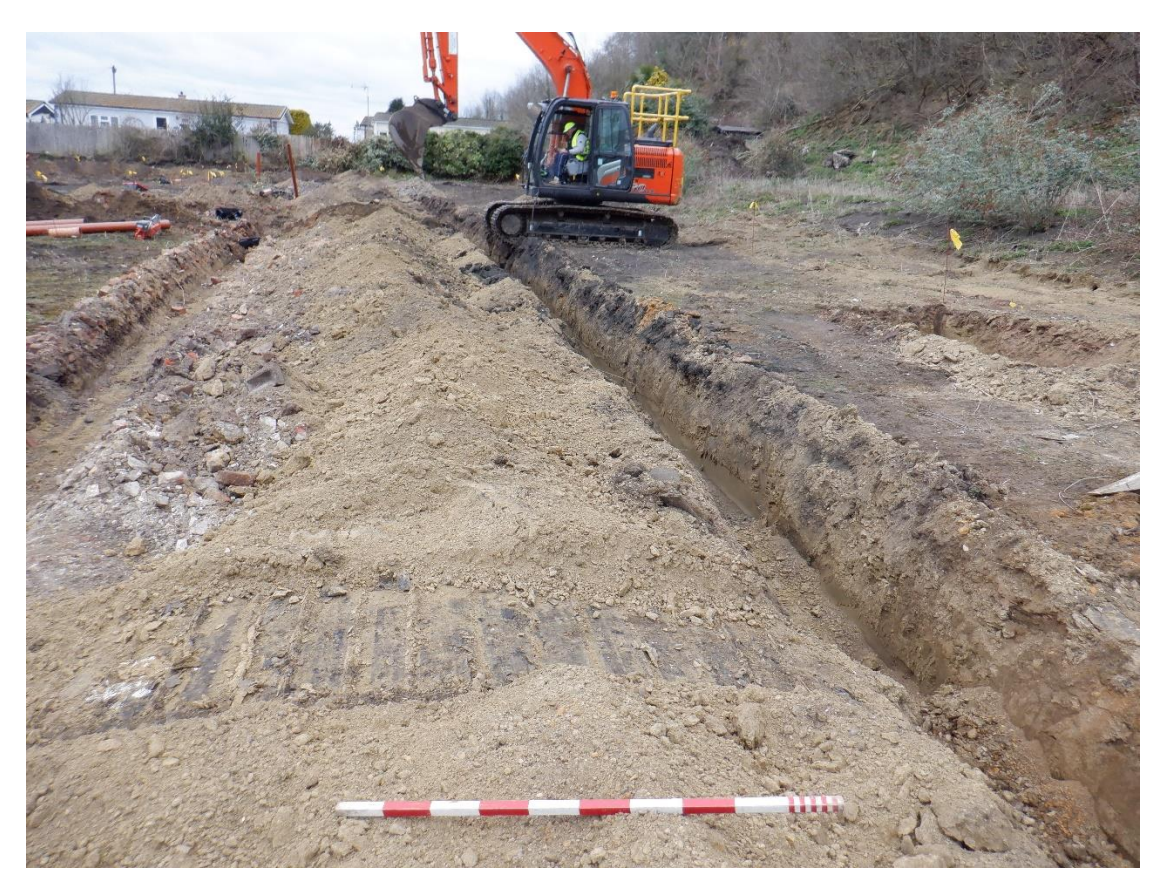
Plate 3. Service trenching (looking NW)