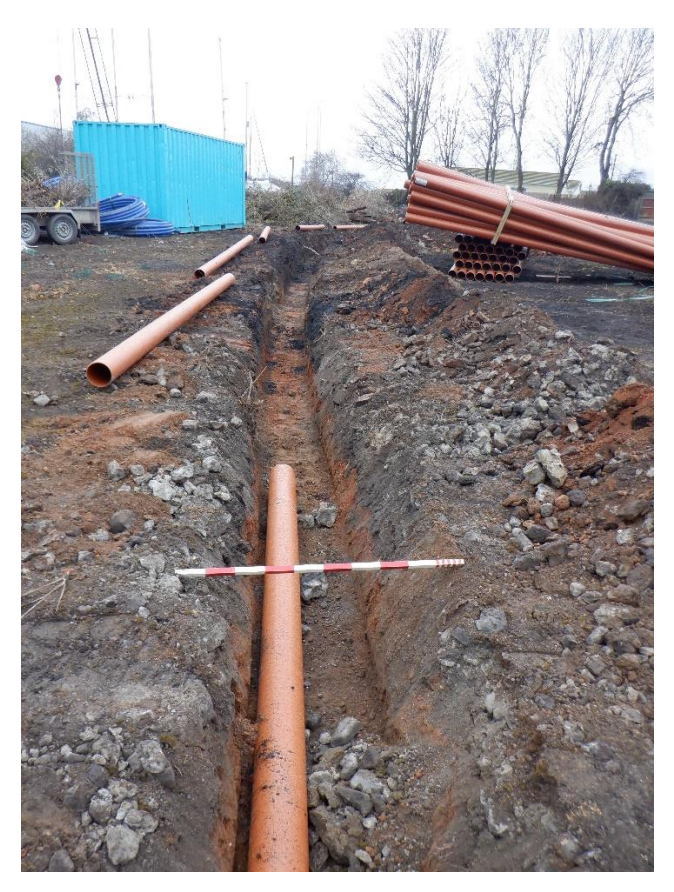
Plate 5. Service trenching (looking East)