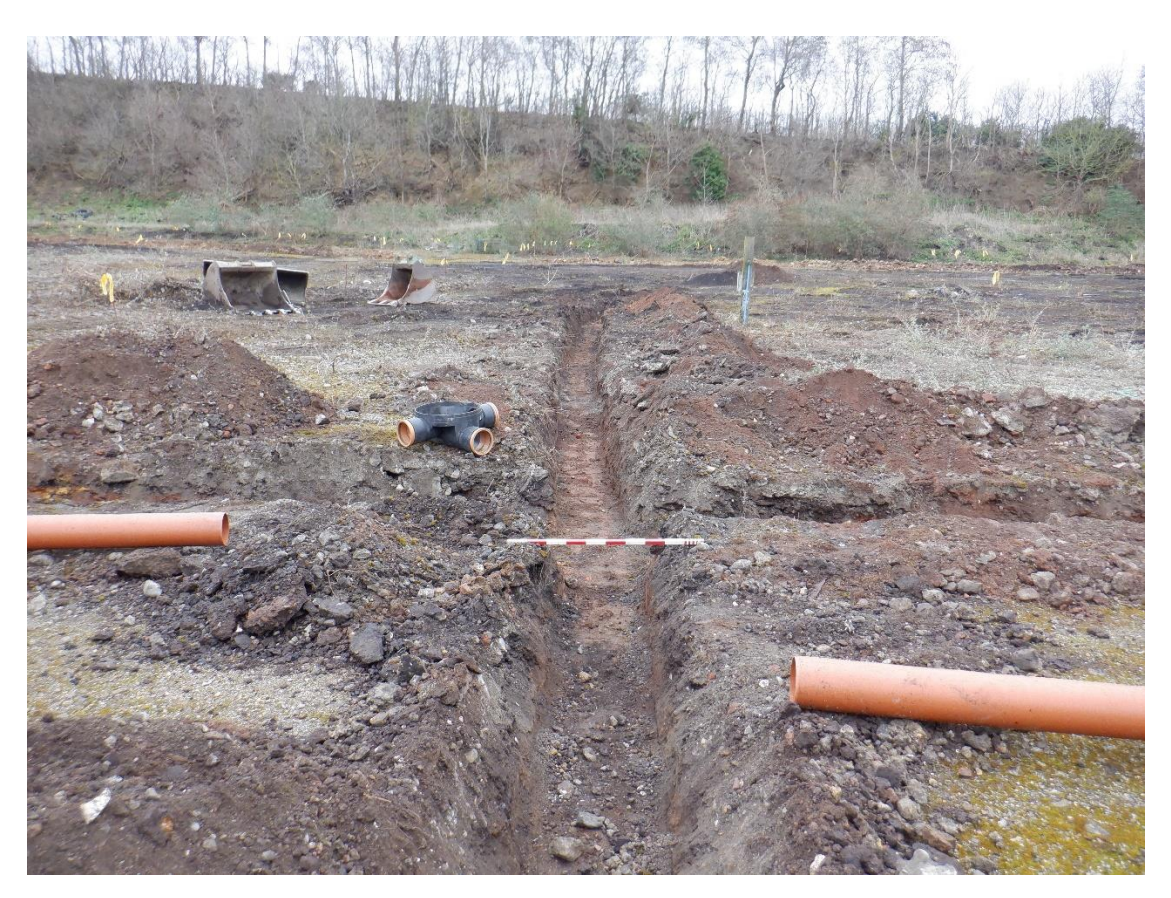
Plate 1. Trenches for pipe runs (looking North)