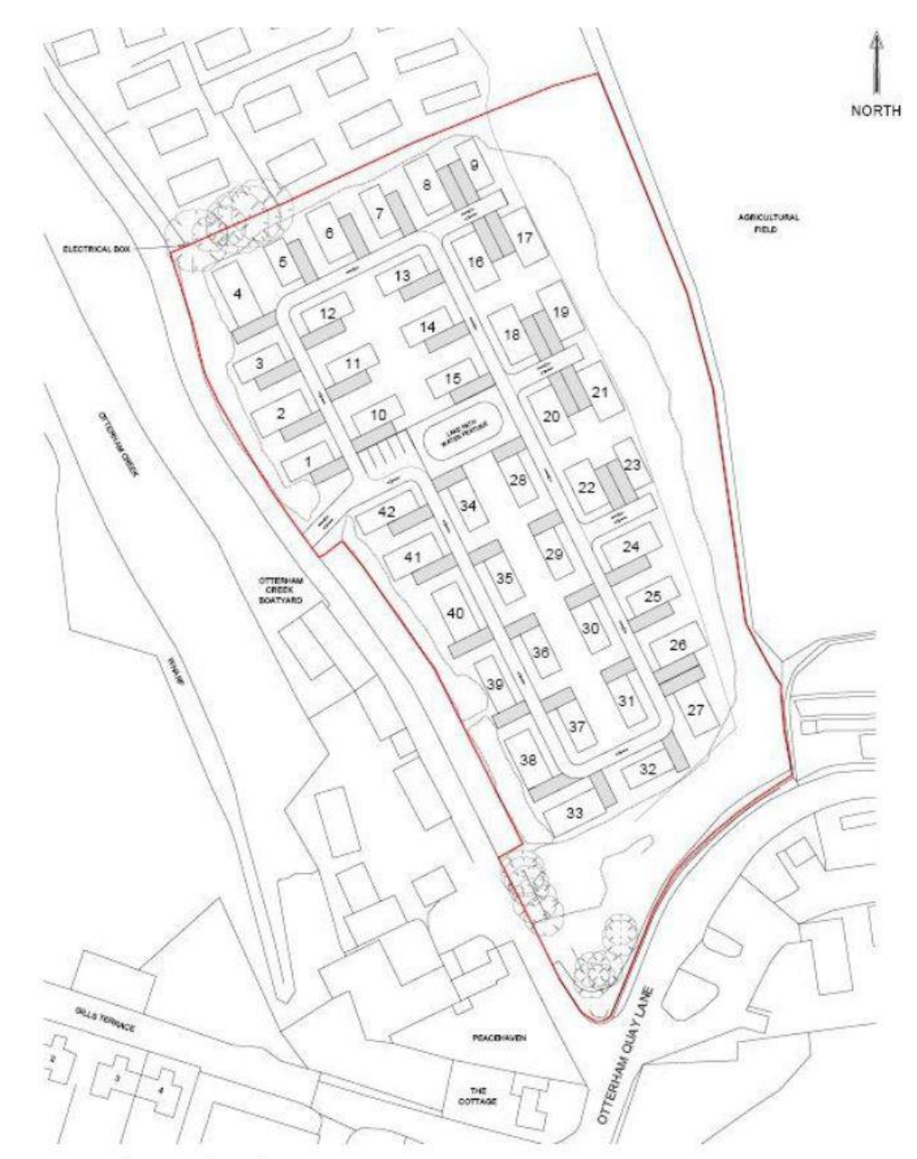
Figure 2. Area of Proposed Development